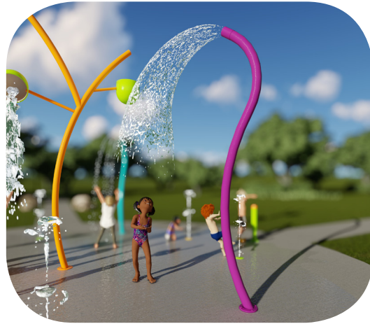
Mission Hill Spill™ W326-3C