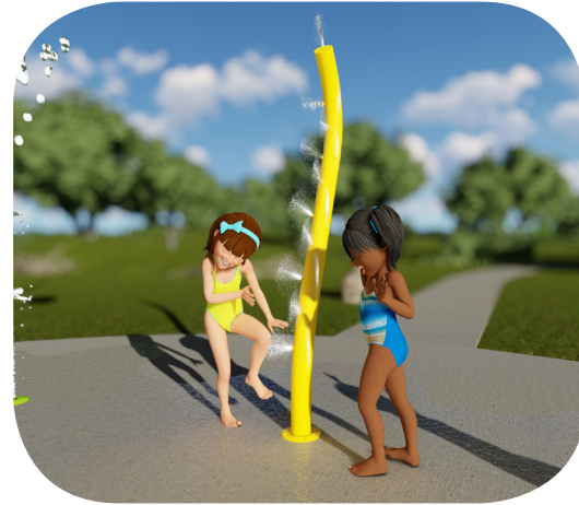
Mission Hill Mister™ W326-1