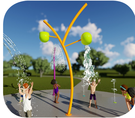
Dew Drop Buckets™ W356