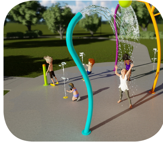
Mission Hill Shower™ W326-2C