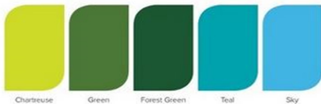
Chartreuse Green Forest Green Teal Sky