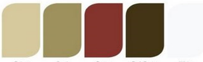
Beige Sand Brown Dark Brown White