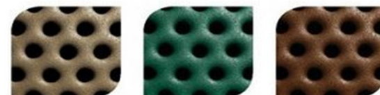
Sand Green Brown