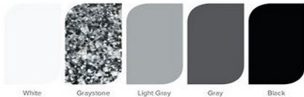
White Graystone Light Gray Gray Black (Boots Only)