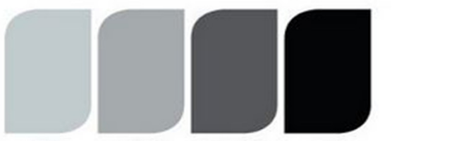
Silver Light Gray Metallic Gray Black (Posts & Dumps Only)