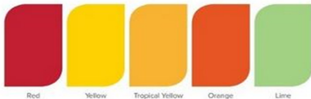
Red Yellow Tropical Yellow Orange Lime

Produced with a compound resin, UV stabilizers, and anti-static guard for superior color fastness, strength, and durability.