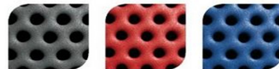
Charcoal Gray Red Blue

Available coating colors for decks, steps, ramps, and bridges are shown below. Some colors are not available on certain structures—see your representative for details.