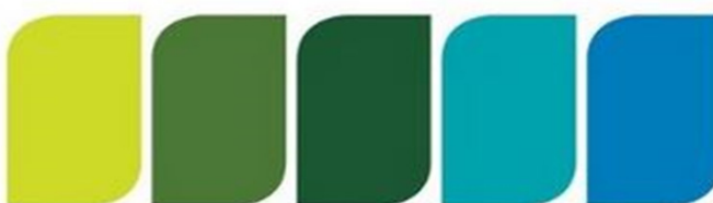
Chartreuse Green Forest Green Teal Azure