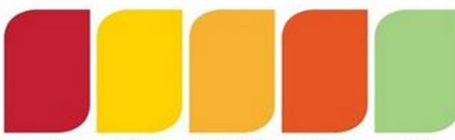
Red Yellow Tropical Yellow Orange Lime

Achieved with a multi-layer paint application process that combats rust/corrosion and ensures a long-lasting finish.