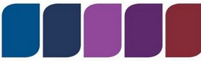
Blue Cobalt Lavender Plum Burgundy