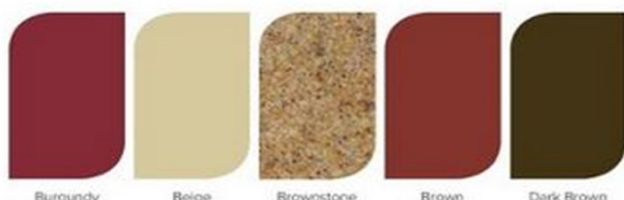
Burgundy Beige Brownstone Brown Dark Brown